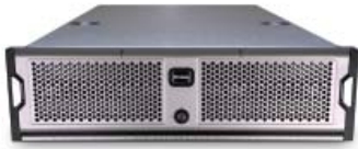
DSN-3200-10 - 8x1GbE iSCSI SAN Array, 15 Bays, 3U