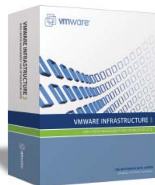
VMware provides backup and failover capability for American Land Lease

Virtualization Performance suggested a simple and cost-effective solution with D-Link and VMware. They migrated American Land Lease’s servers to the data center and run them on VMware ESX and D-Link DSN-3200 SAN. This allowed them to be in a hardened data center, improve performance and easily failover to the disaster recovery site.