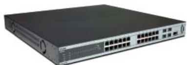
DXS-3227P - 24-Port PoE Gigabit Wireless-Ready Switch + (4) Combo SFP Ports + (1) Fixed XFP Port + (2) Optional 10-Gig Copper/Fiber Uplinks