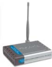
DWL-2200AP High Speed 2.4GHz (802.11g) Wireless 108Mbps 1 Access Point With PoE