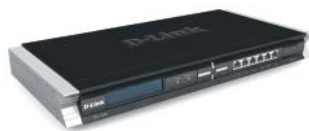
DFL-1600 - Rackmount VPN Firewall