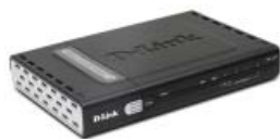
DFL-210 - Network Security Firewall